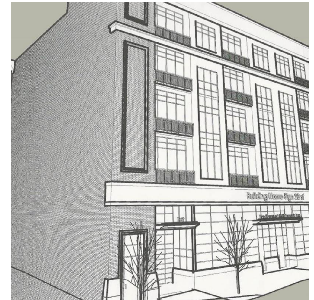
860 NEWARK AVE.

Nearing retirement, a long-term client and lifetime investor became interested in disposition of one of her portfolio's larger assets. We were able to close despite a blizzard and last-minute negotiations at the closing table.