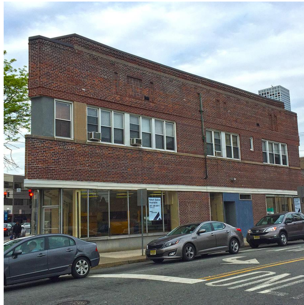
2800 KENNEDY BLVD.

We believe our formula allows for a less crowded look for value-added projects and properties. Our Sellers can profit from exiting neighborhoods on the upswing and our Buyers can acquire projects with room for growth. We pride ourselves on world-class professionalism with a local application.