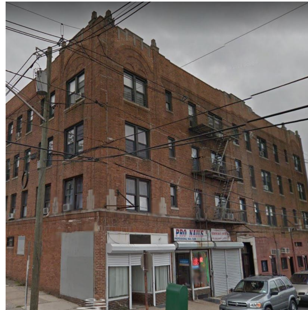
164 STERLING AVE.

A professional recommendation led to a corporate client that leased properties nationally under a global, publicly-traded parent company. We were able to sell the property and provide additional capital for the business to redeploy.