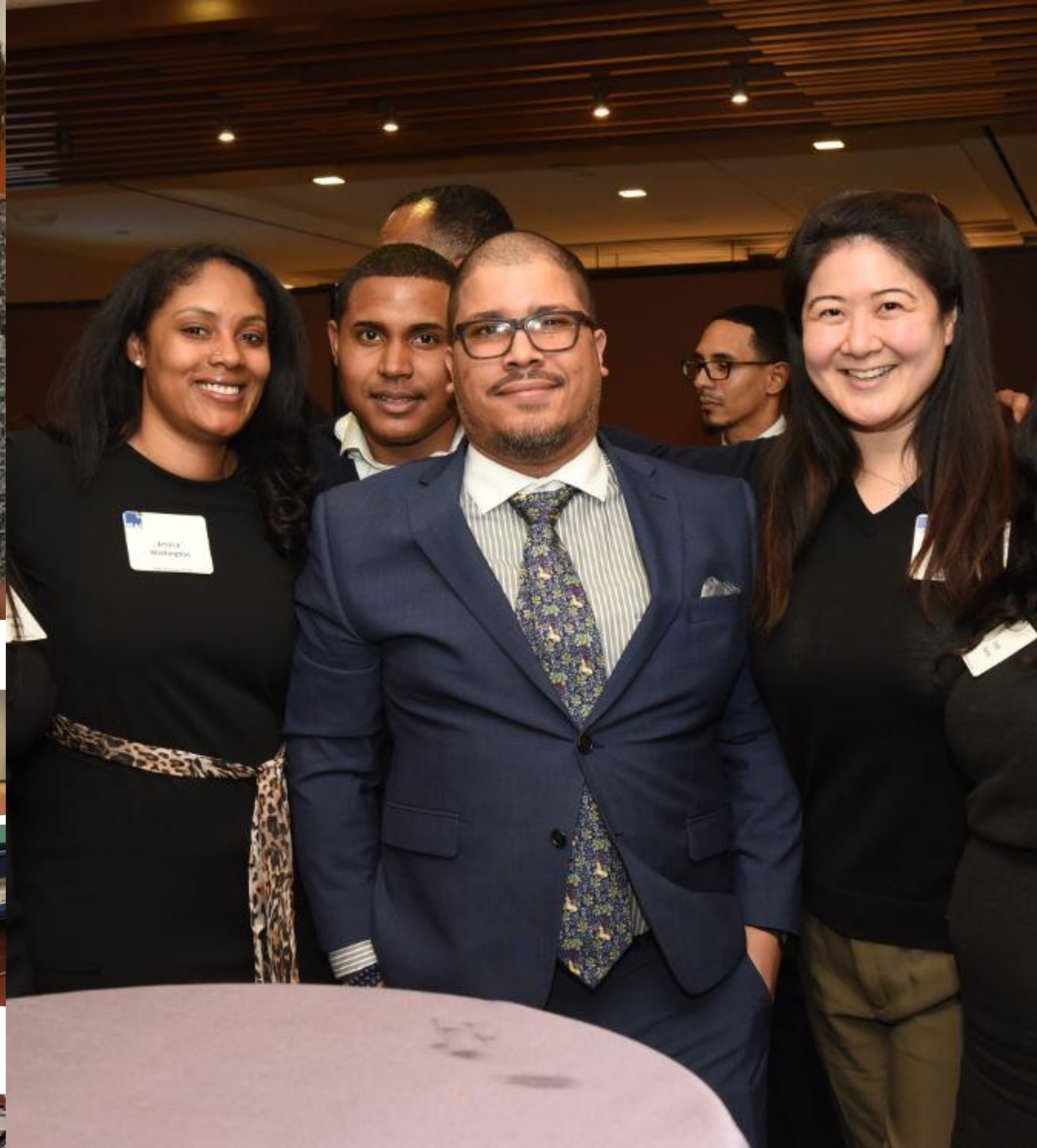
PAPER CITY REAL ESTATE TEAM & FRIENDS OF THE FAMILY!